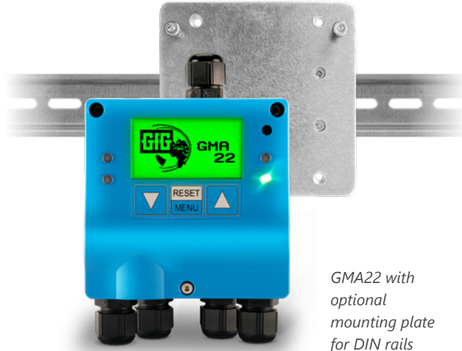
GMA22 with optional mounting plate for DIN rails

Even more flexibility results from the option to address not only the transmitters but also up to 4 additional relay modules of type GMA200-RT or GMA200-RTD via the digital RS485 interface.