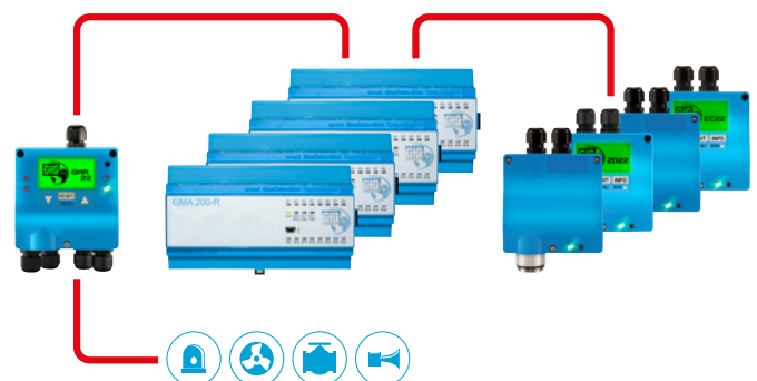
GMA22 maximum configuration

ACDC (Analog Carrier for Digital Communication) is a patented technology of GfG. It allows an analog transmitter to communicate with a controller via a 4-20 mA line in the same way that a digital transmitter communicates via a bus connection. This allows, for example, for remote calibration of an analog transmitter. However, the prerequisite is that both devices are ACDC-capable.