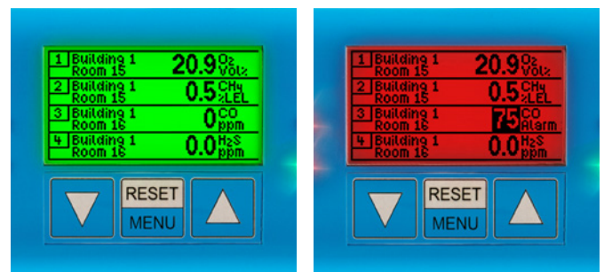
Measured value overview in normal or alarm state

The current measured values of all transmitters are continuously displayed on the 2.2" LCD. The operating status is indicated by the status LEDs. In normal operation, only the green LED is lit. A yellow LED indicates malfunctions or service work. In the event of an alarm, the background color of the display changes from green to red and only the measured values of the measuring points at which the limit values were exceeded or fallen below are displayed. Red LEDs indicate the alarm level. In addition, an acoustic warning signal sounds.